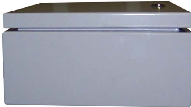
Figure 4 – Close-Up of Outside, Seamless Surface