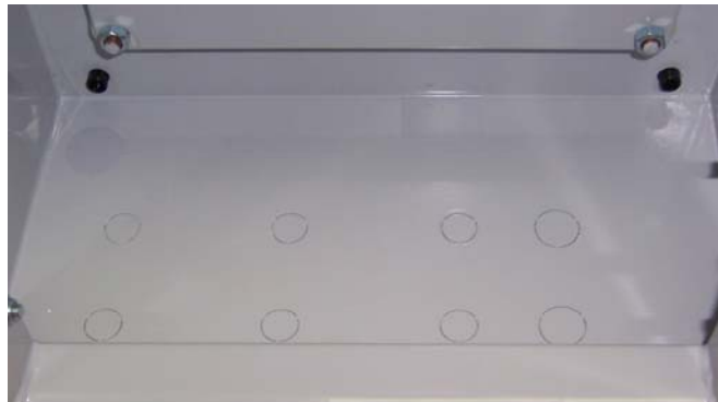
Figure 3 – Close-Up of Knockouts Inside the Enclosure