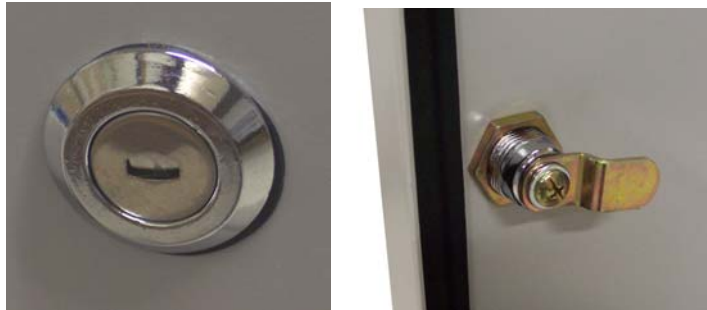
Figure 5 – Close-Up of Lock Outside and Inside the Enclosure Door