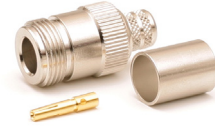
TWS-400 Series N-Style Plug