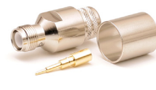
TWS-600 Series RPTNC Jack (F)