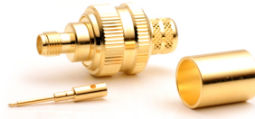
TWS-600 Series SMA Jack (F)