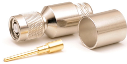
TWS-600 Series RPTNC Plug (M)