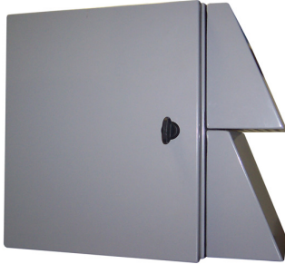
16x12x8 UL Approved Steel Heated & Cooled Enclosure TerraWave Part Number: TWSD16128PHC-UL

The NEMA 3R rated steel enclosures are perfect for indoor or outdoor use to help protect wireless equipment from the elements, theft or damage. The heated/cooled element is ideal for enabling 802.11 networks in harsh environments. These affordable solutions make it easy to mount and protect wireless products. Wi-Fi enclosures are used in nearly all vertical markets where the protection and enhancement of a wireless network is crucial.